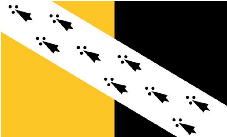
Flag of Norfolk